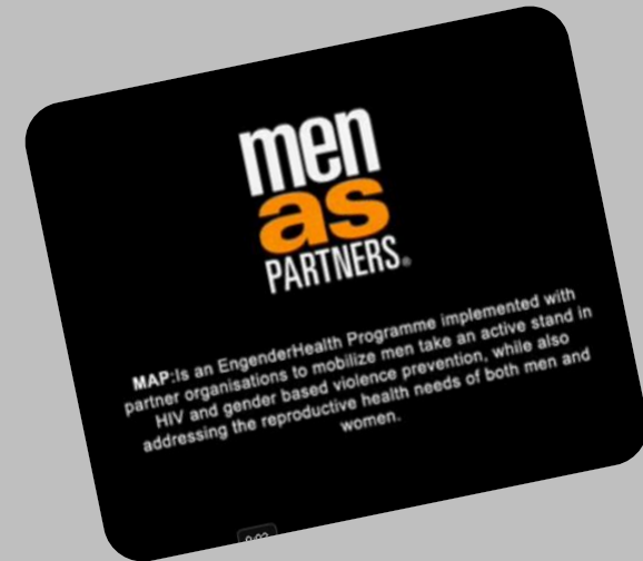
Men As Partners – South Africa