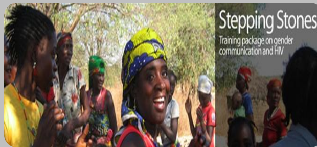
Stepping Stones – South Africa