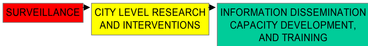
Figure 2: Strategic Framework of the MRC-UNISA Crime, Violence and Injury Lead Programme (2005-8)

Capitalising and building on the rapidly emerging programmatic and research skills, the CVI will make a shift away from descriptive data generation to greater inferential and analytical research within specific identified priority areas. The logical termination of a range of projects will free up energies and expertise towards analytical focussed studies in three areas. These include the ongoing need for mortality injury surveillance to provide accurate, reliable and timely national, provincial and city-level data to direct analytical research, intervention and policy prioritisation; city-level research and interventions that will cut across the identified priority areas of violence, suicide, unintentional childhood injuries, and traffic injuries; and capacitation and information dissemination (see Figure 2). Training, capacitation and information dissemination will remain a central priority for the Lead Programme so as to strengthen the research-policy nexus, ensure appropriate data uptake, facilitate sectoral and inter-sectoral building, and encourage knowledge transfers and exchanges.